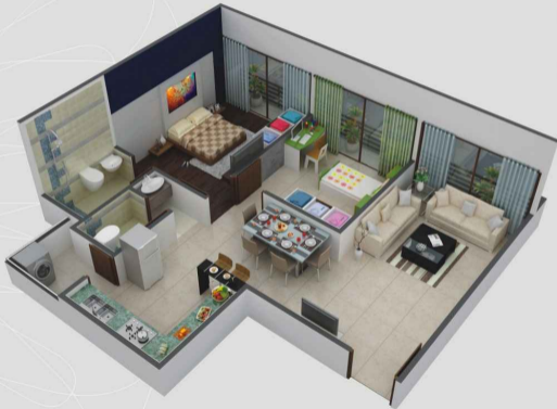
unit type C