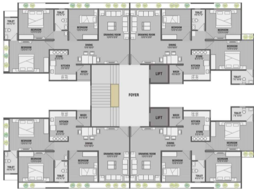
unit type A-B 3 bhk