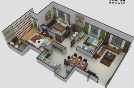
unit type A-B